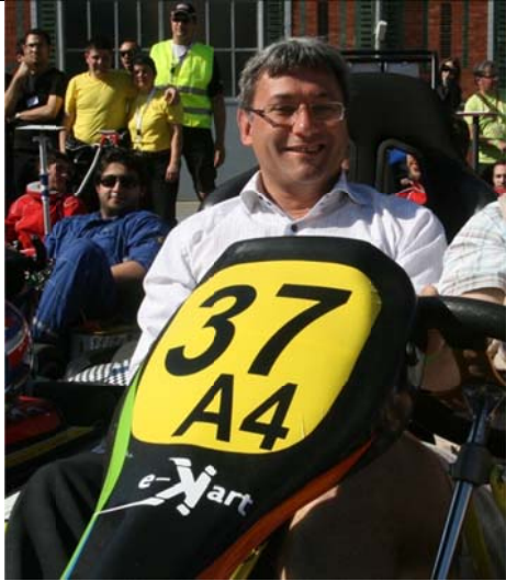
The nassau panel

The kart will wear his number legibly on the front panel nostril on the two sides and rear. The kart number is the number of the team, 37H, for example, if there is only one kart. It is followed by a number if there are several karts in the team: 37H1 and 37H2.