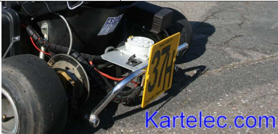
On the rear panel of the kart