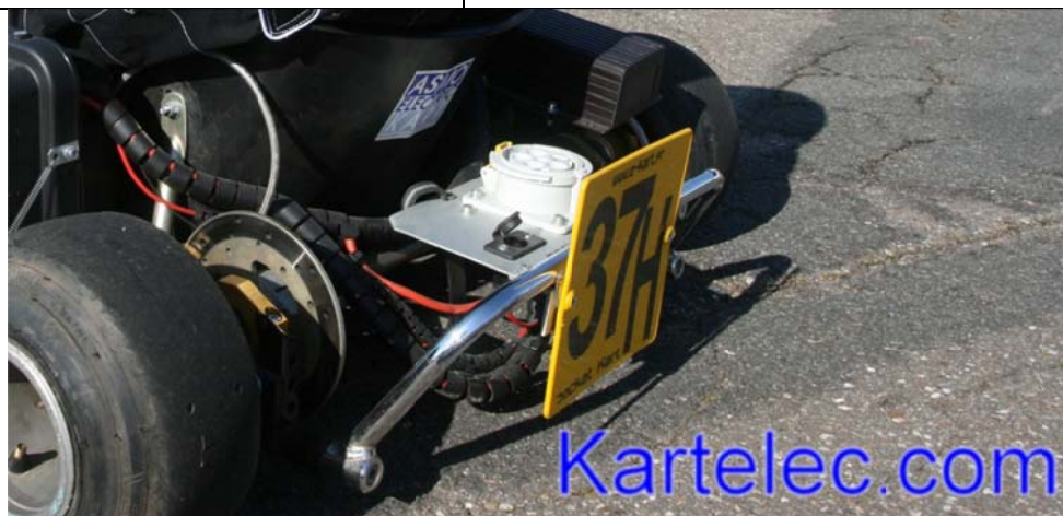
On the rear panel of the kart