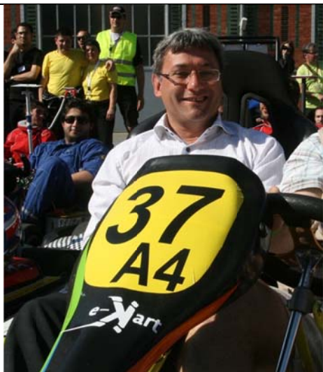
The Nassau panel

The kart will wear his number legibly on the front panel nostril on the two sides and rear. The kart number is the number of the team, 37H, for example, if there is only one kart. It is followed by a number if there are several karts in the team: 37H1 and 37H2.